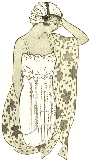
Now it's the low-bust corset skillfully shaped for the short, heavy woman