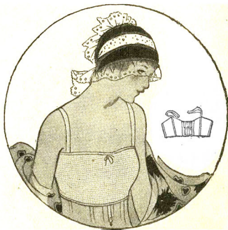
There's no wear out to the back springs of this bandeau brassière

F IRST the corset and always the corset! Fashions come, and fashions go, but the corset is the foundation upon which they are all built.