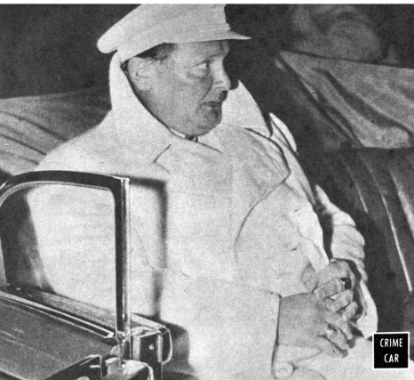
In rear seat of especially-built, bullet-proof Mercedes cabriolet, Reichsmarshall Hermann Goering sadly contemplates then-uncertain future. Later, on May 9, 1945, he surrendered to the U. S. Army.