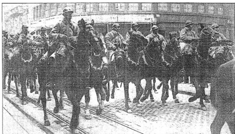
"A MORAL STATE OF WAR."

The advance of French and Belgian troops into the Ruhr valley is considered by the Germans as putting their country in "a moral state of war with France and Belgium," which the Germans will wage with the weapons of "sabotage and inertia."