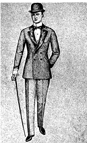
Double breasted dark blue dinner suit, facings and cuffs of dark blue satin. Single breasted waistcoat.

no reason why they all should not know and care — as they should care and know about the proper use of the knife and fork, for it is as easy to do most things properly as wrongly.