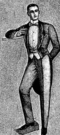
Dark blue evening suit. Shawl collar facings of dark blue satin. Piqué waistcoat, shirt and tie. Plain collar.

Dress & Vanity Fair Fashions · The Stage · Society · Sports · The Fine Arts