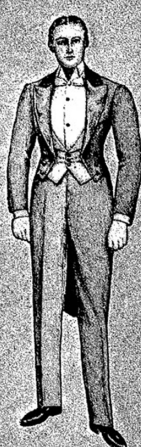
Black evening suit. Facings of brilliant silk. Velvet collar. Plain white linen waistcoat, shirt, collar and tie.