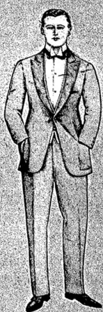
One button oxford gray dinner suit. Facings of dull silk. White piqué waistcoat that has rolled collar.

JEWELRY: There is so much offered, so much that may be suggested, it could be an article in itself. I think if a man is not sure he had best use as little as possible, and that as simple as possible, then he will be quite right. For him I would suggest two round pearls in the shirt bosom and mother of pearl links centred by a pearl in the cuffs, and plain white buttons on the waistcoat.