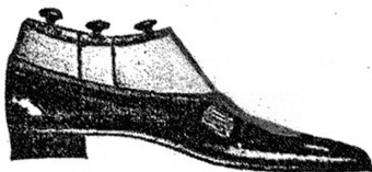
Soft toe patent leather pumps. Thin soles, long vamps. Opening bound with corded silk, flat bow of corded silk

I DINED, a few evenings ago, with some men at a place where one sees the beau monde of New York. During coffee we were joined by a man prominent in London and in Paris, for his connection with great monetary affairs. It is said that he is very rich and also, a hard working man — one whose strenuous labors often consume many hours of the day. With this in mind I could but admire his appearance, his well groomed hair, his well fitting evening clothes, his well varnished shoes and the pearls in his linen. He wore nothing extreme; all was in black and white. It was the nicety of values in everything, with a certain unconsciousness, that made the perfect ensemble of a man who seemingly did not care—but knew. Around me, at other tables, were many men known in this world of New York — amongst them it was not difficult to find — perhaps a few — who were arrayed in immaculate but unimaginative evening clothes. There was an expression of struggle in what they had on, the latest finishings that fashion calls for, yet clothes which fitted more as country clothes do and not as evening dress should — and again in badly tied ties, exaggerated waistcoats, jarring jewelry, and impossible shoes. They were men who cared but did not know. I see